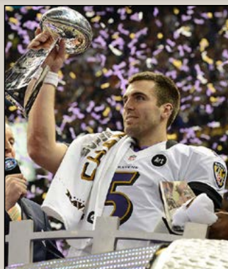
QB Joe Flacco - 2012 Super Bowl XLVII MVP

In a magnificent effort showcasing thrilling performances by their defense, offense and special teams units, the Baltimore Ravens won Super Bowl XXXV with a 34-7 victory over the New York Giants. Allowing the Giants a meager 152 total net yards, New York's attack crossed midfield just twice, while Baltimore's "D" posted 4 INTs. LB Ray Lewis was named the game's MVP, capping an accolade-filled season in which he was also tabbed the NFL's Defensive Player of the Year.