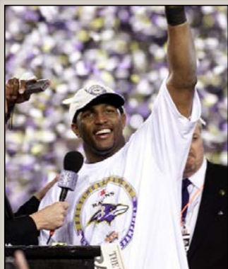
LB Ray Lewis - 2000 Super Bowl XXXV MVP

In a magnificent effort showcasing thrilling performances by their defense, offense and special teams units, the Baltimore Ravens won Super Bowl XXXV with a 34-7 victory over the New York Giants. Allowing the Giants a meager 152 total net yards, New York's attack crossed midfield just twice, while Baltimore's "D" posted 4 INTs. LB Ray Lewis was named the game's MVP, capping an accolade-filled season in which he was also tabbed the NFL's Defensive Player of the Year.