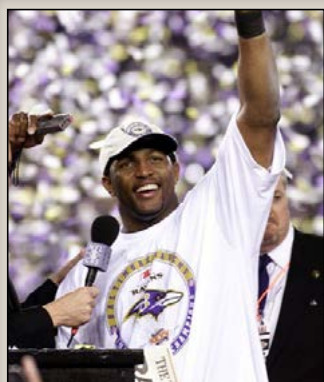
LB Ray Lewis - 2000 Super Bowl XXXV MVP

In a magnificent effort showcasing thrilling performances by their defense, offense and special teams units, the Baltimore Ravens won Super Bowl XXXV with a 34-7 victory over the New York Giants. Allowing the Giants a meager 152 total net yards, New York's attack crossed midfield just twice, while Baltimore's "D" posted 4 INTs. LB Ray Lewis was named the game's MVP, capping an accolade-filled season in which he was also tabbed the NFL's Defensive Player of the Year.