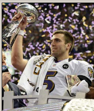
QB Joe Flacco - 2012 Super Bowl XLVII MVP

In a magnificent effort showcasing thrilling performances by their defense, offense and special teams units, the Baltimore Ravens won Super Bowl XXXV with a 34-7 victory over the New York Giants. Allowing the Giants a meager 152 total net yards, New York's attack crossed midfield just twice, while Baltimore's "D" posted 4 INTs. LB Ray Lewis was named the game's MVP, capping an accolade-filled season in which he was also tabbed the NFL's Defensive Player of the Year.