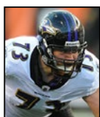
RG Marshal Yanda GP/GS: 120/109 Four-Time Pro Bowler