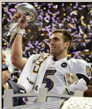
QB Joe Flacco - 2012 Super Bowl XLVII MVP

In a magnificent effort showcasing thrilling performances by their defense, offense and special teams units, the Baltimore Ravens won Super Bowl XXXV with a 34-7 victory over the New York Giants. Allowing the Giants a meager 152 total net yards, New York's attack crossed midfield just twice, while Baltimore's "D" posted 4 INTs. LB Ray Lewis was named the game's MVP, capping an accolade-filled season in which he was also tabbed the NFL's Defensive Player of the Year.