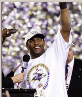
LB Ray Lewis - 2000 Super Bowl XXXV MVP

In a magnificent effort showcasing thrilling performances by their defense, offense and special teams units, the Baltimore Ravens won Super Bowl XXXV with a 34-7 victory over the New York Giants. Allowing the Giants a meager 152 total net yards, New York's attack crossed midfield just twice, while Baltimore's "D" posted 4 INTs. LB Ray Lewis was named the game's MVP, capping an accolade-filled season in which he was also tabbed the NFL's Defensive Player of the Year.