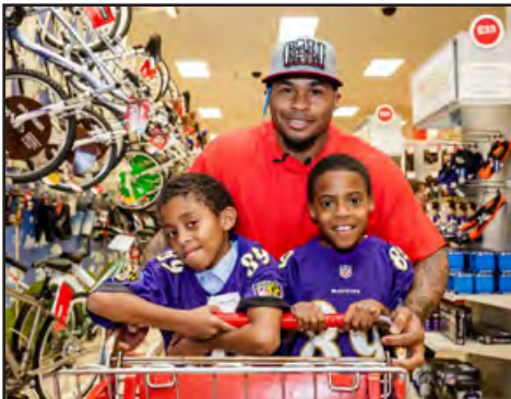
WR Steve Smith Sr.