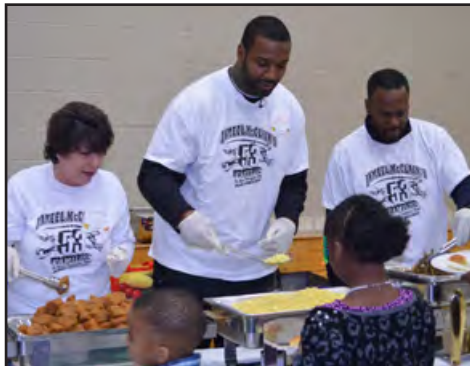
DE Chris Canty