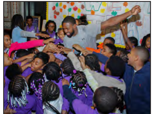
WR Torrey Smith