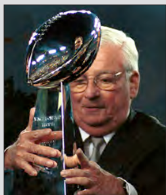
Owner Art Modell - 2000 Super Bowl XXXV

In a magnificent effort showcasing thrilling performances by their defense, offense and special teams units, the Baltimore Ravens win Super Bowl XXXV with a 34-7 victory over the New York Giants. Allowing the Giants a meager 152 total net yards, New York's attack crosses midfield just twice, while Baltimore's "D" posts 4 INTs. LB Ray Lewis is named the game's MVP, capping an accolade-filled season in which he was also tabbed the NFL's Defensive Player of the Year.