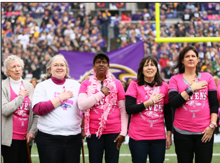
BCA Game Honorees

During the month of October, the Baltimore Ravens support Breast Cancer Awareness Month through a variety of initiatives, highlighted by last Sunday's Ravens vs. Packers game at M&T Bank Stadium. The initiatives incorporated at that game included the distribution of over 50,000 pink ribbons to fans who entered the stadium, an on-field ceremony honoring 22 women – a combination of breast cancer survivors and those currently undergoing treatment – prior to kickoff and the numerous pink elements worn by players, coaches, cheerleaders and mascot Poe during the game. The merchandise worn was collected after the game and will be auctioned off at www.nfl.com/auction , with proceeds benefitting the American Cancer Society. Breast Cancer Awareness Month was also recognized on the high school level when the Catonsville Comets hosted the Milford Mill Millers at their homecoming game on Friday (10/11). Both varsity teams sported pink gear, and the field was decorated with breast cancer awareness banners, all donated by the Ravens.