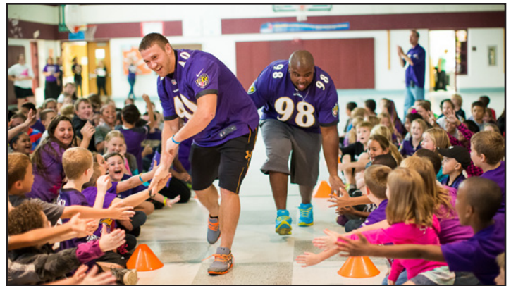
FB Kyle Juszczyk and DT Brandon Williams