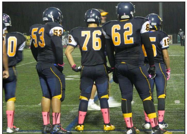
Catonsville High School Players