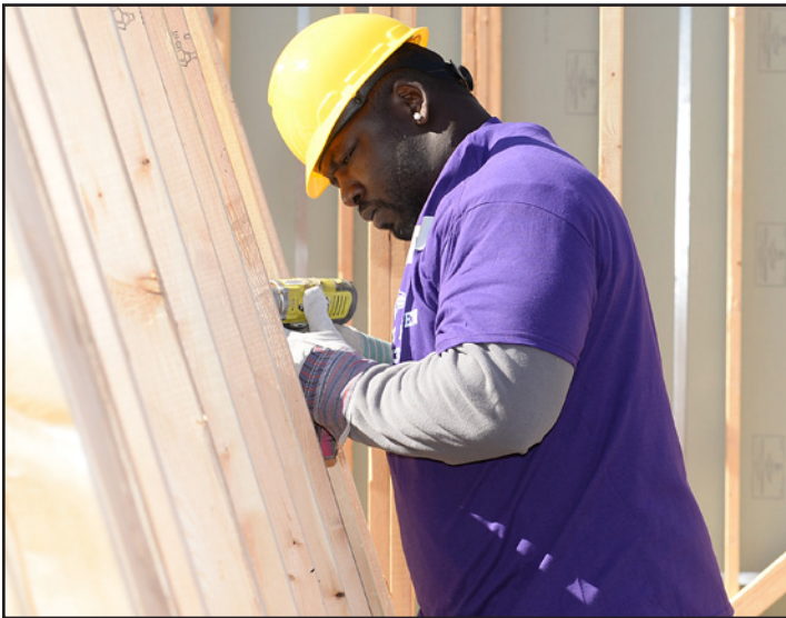
FB Vonta Leach