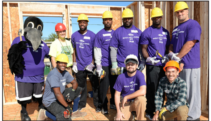
Ravens Players and Habitat Staff