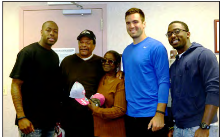
QBs Dennis Dixon, Joe Flacco and Tyrod Taylor

In an effort to further support Breast Cancer Awareness, Ravens QB Joe Flacco , QB Tyrod Taylor and QB Dennis Dixon visited cancer patients at MedStar Franklin Square Medical Center on Tuesday (10/16). Dixon, who lost his mother to breast cancer, knows the importance of awareness and is a huge supporter of this initiative. The three players visited patients in the Harry and Jeanette Weinberg Cancer Institute and the inpatient oncology unit. While visiting, the players took photographs with patients and distributed pink Ravens hats and footballs.