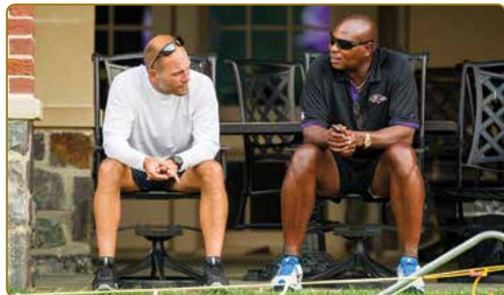
Eric DeCosta and general manager/executive vice president Ozzie Newsome attend Ravens practices together, working closely to make decisions on the team's football personnel.

1996-2017: (with Baltimore) 2017: Selected Alabama CB Marlon Humphrey in the first round, followed by OLB Tyus Bowser (second) and two third-rounders: DE Chris Wormley and OLB Tim Williams...Ravens signed CB Brandon Carr, S Tony Jefferson, WR Jeremy Maclin and RB Danny Woodhead in free agency. 2016: Draft picks T Ronnie Stanley (No. 6 overall), G/T Alex Lewis (fourth round), CB Tavon Young (fourth) and RB Kenneth Dixon (fourth) all earned significant playing time as rookies...Ravens also signed key free agents WR Mike Wallace and S Eric Weddle, who earned his fourth Pro Bowl in his first year as a Raven. 2015: WR Breshad Perriman (first) and TE Maxx Williams (second) were tabbed